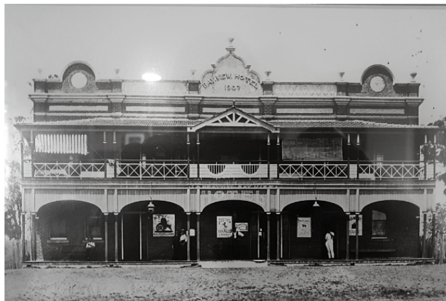
Bayview Hotel, Woy Woy 1910